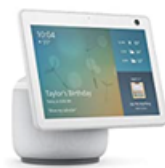
Echo Show 10 (3rd Gen) | HD smart display with... Amazon

Only households that have an Amazon or Ring device installed need to do anything. If you don't own one of these devices, you have nothing to worry about, for now, until you do own one in the future.