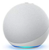
Echo (4th Gen) | With premium sound, smart... Amazon