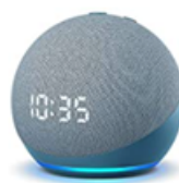
All-new Echo Dot (4th Gen) | Smart speaker... Amazon