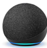
All-new Echo Dot (4th Gen, 2020 release) | S... Amazon