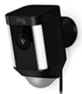
Ring Spotlight Cam Wired: Plugged-in HD... Ring