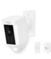
Ring Spotlight Cam Mount, Hardwired HD... Ring