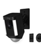
Ring Spotlight Cam Mount, Hardwired HD... Ring