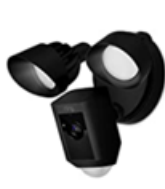
Ring Floodlight Camera Motion-Activated HD S... Ring