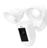
Ring Floodlight Camera Motion-Activated HD S... Ring