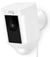
Ring Spotlight Cam Wired: Plugged-in HD... Ring