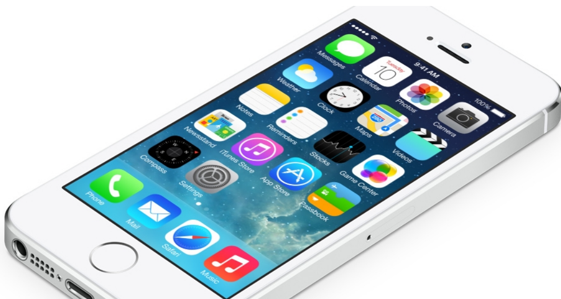
iOS New Look

The big news last month was Apple's release of their new operating system for iPhones , iPads and iPod touches called iOS 7. When you see any news about "iOS" this has to do with the operating system (OS) for Apple's portable devices. This is not the same thing as the operating system for Mac computers. That is called "OS X" and the next new version of OS X, 10.9 Mavericks, will not be out until later this year.