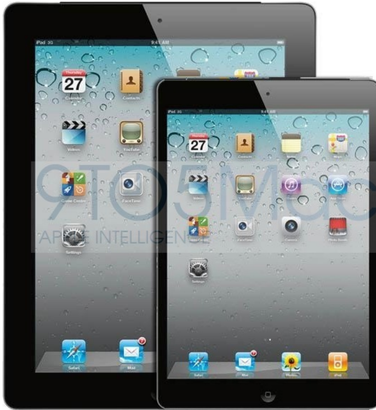
iPad mini vs. full size iPad

Apple is not resting on its laurels for the holidays. In September Apple released the new iPhone 5 which now uses true 4G for Internet and has a larger screen. Last month they introduced the brand new iPad mini which is a smaller version of the very popular full size iPad. And to everyone's amazement only 6 months after introducing the last full size iPad they have upgraded it again with a faster A6X processor.