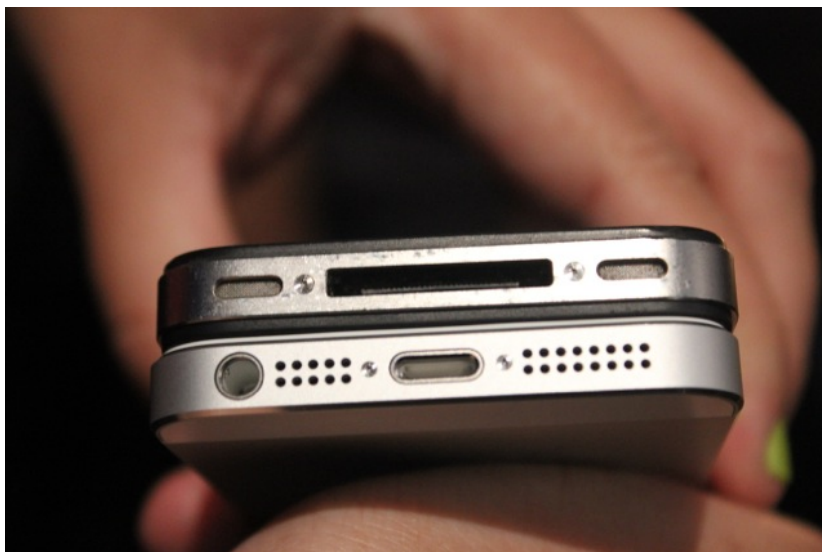
30-pin connector (top) vs. Lightning Connector