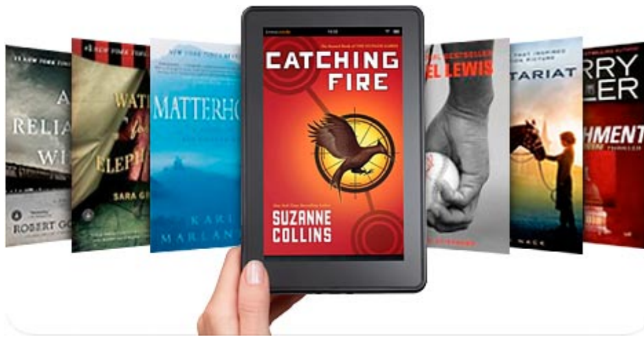
Amazon Kindle Fire

The Apple iPad of course is also a great eBook Reader and it does a whole lot more. With 140,000+ apps that can be added to the iPad (we used to call "apps" "software" which is all an app is, a piece of software for your device), it is undeniably the king of the tablet world. Apple has it's own iBook store of course, but on the iPad you can also download the Kindle and Nook Apps so any purchases made on those bookstores can also be read on the iPad . Prices for the iPad start at $499 and go up from there (but there maybe a price cut in the coming months).