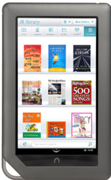
Barnes & Noble Nook Color

The current crop of eBook Readers are looking very impressive. These little devices not only allow you to read books, magazines and newspapers, but on some models you can also check email and look things up on the Internet. My wife received a Barnes & Noble Nook Color for the holidays and I had a chance to give it a test drive (when I could wrangle it away from her). What a great little device it is. Hard to believe what this $199 device can do (and by-the-way I have seen refurbished by Barnes & Noble ones for $139 ).