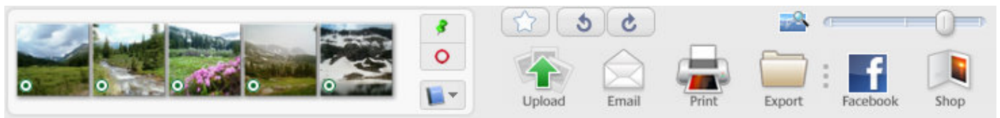
Picasa Bottom Buttons

I thought you might like to know that if you need some prints made of your photos Snapfish is offering a good deal on photo processing: 100 4x6-inch prints for $1 or 200 prints for $2, when you use coupon code JULY100PRNTS or JULY200PRNTS, respectively. You will still pay for shipping (around $5 to $10, depending on how many prints you order), but you're getting the prints for just a penny apiece.