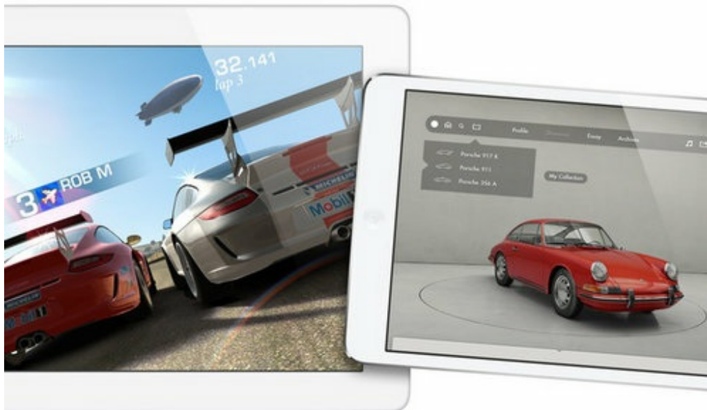
iPad with Retina display